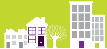
A roadshow to teach tenants about money matters