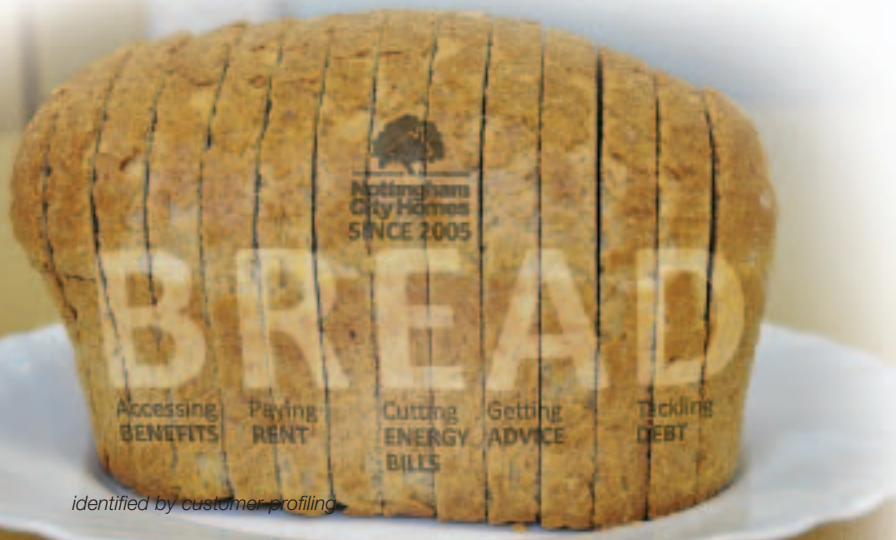
identified by customer profiling

The BREAD campaign showed us that most of our tenants want to pay their rent but can't, rather than 'can but won't'. We found that many people didn't realise they were entitled to the benefits available to them, or didn't feel confident to switch energy suppliers, or claim their council tax credit. The campaign became more about educating our tenants on how to manage their money, than stepping in to help in a crisis.