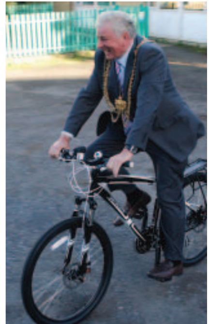
On two wheels for estate improvements

officers are, tenants' perception of them has been improved.