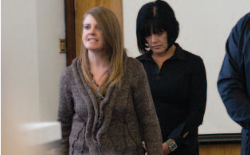
Derby Homes staff perform part of their role from the DVD

Derby Homes' groundbreaking dramatisation hits home