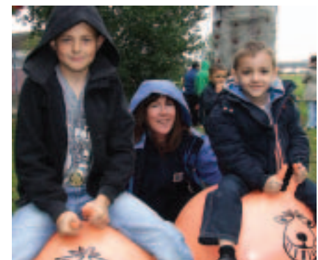
Bringing Offerton together