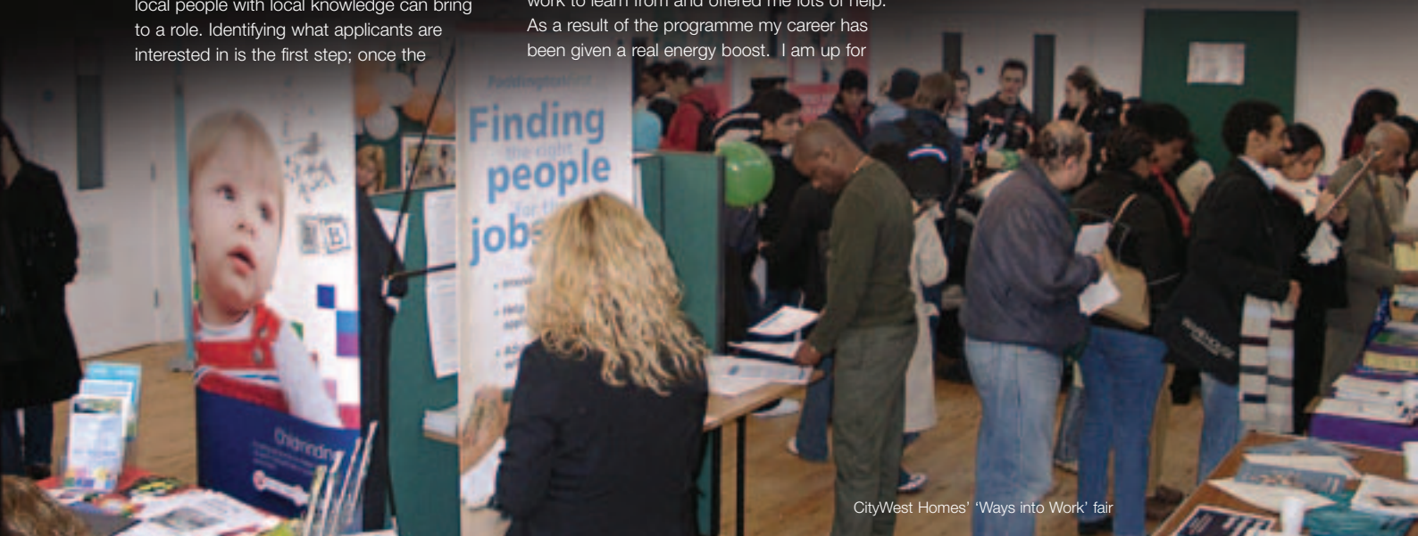
CityWest Homes' 'Ways into Work' fair

From the beginning, the team has wanted to fully understand the challenges involved. By developing a coordinated approach to employment and training issues, it has been able to provide residents with a faster, more efficient and thorough response to their employment needs. The knowledge that the team has gained can help people change their lives and gain employment and skills to further their career. The team has seen the difference its contribution has made to the lives of hundreds of residents – and this can only help enhance our community for the better.