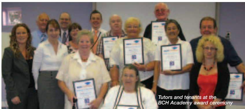
Tutors and tenants at the BCH Academy award ceremony